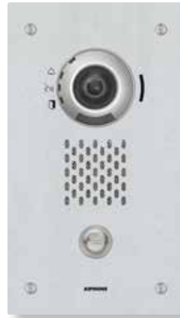
IX-DVF IP Video Door Station