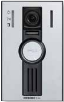
IX-EA 1-Gang Surface Mount IP Video Door Station