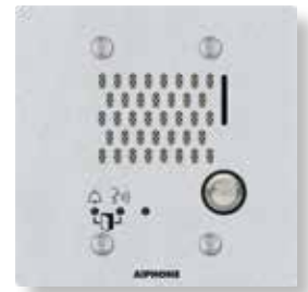
IX-SS-2G Audio Door Station