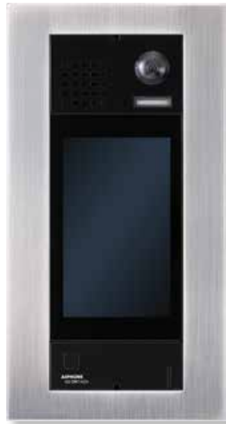
IXG-DM7-HID/A IP Video Door Station with HID® Card Reader

Our intercoms are SIP and ONVIF compliant, allowing seamless integration with leading providers of IP cameras, video management systems, and access controls. This open architecture empowers you to build a customized security ecosystem that evolves alongside your needs.