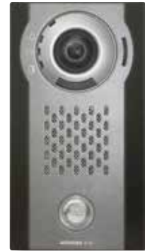
IX-DV IP Video Door Station