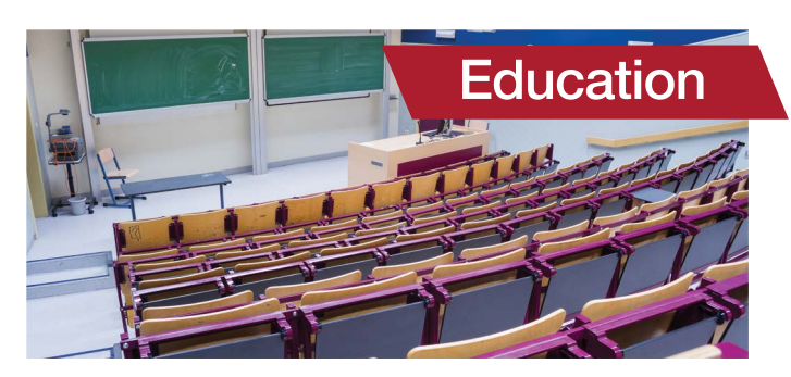
Interactive White Boards • Voice Lift • Projection Mass Notification • Clock Systems • Control Gym & Auditorium Sound • Assisted Listening