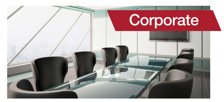
Presentation Systems • Sound Masking • Video Walls Surveillance • Networking • Conferencing Control • Lighting

Choose the winning combination: ADI's leading brands, support services, dedicated sales team and you!