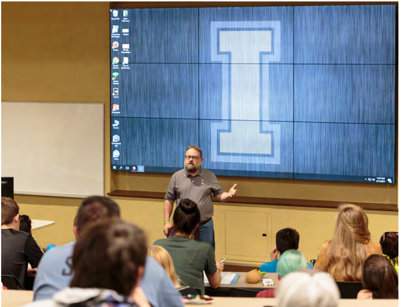
LG Super Narrow Bezel Video Wall - 55LV35A

LG is one of the world's top manufacturers of digital signage technology. Their vast suite of offerings range from high-end LG OLED, LED, Zero-Client virtual desktop, interactive touchscreens and digital whiteboards. With true-colors, UltraHD, blackest blacks and wide viewing angles, LG's digital signage displays stand out anywhere on campus. Plus, with total digital signage solutions extending to software like Cisco compatible displays, Crestron Connected Certified screens and LG's webOS for managing and monitoring screens and display content – LG offers a complete signage solution.