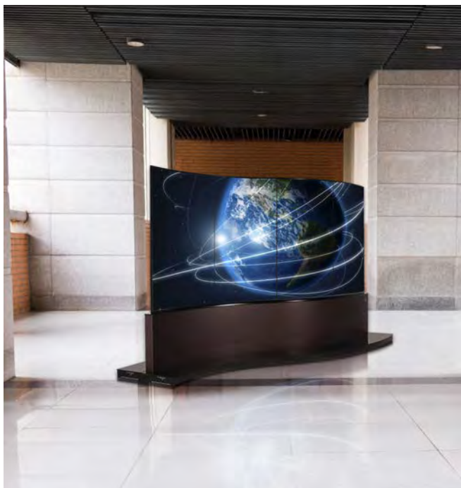
Dual-View Curved Tiling LG OLED Display - 65EE5PC

Today's digital signage models are thinner and lighter than ever before. No longer are displays square or rectangular screens mounted on a wall. New form factors like dual-sided, concave and convex applications are now becoming increasingly popular. It's not uncommon to see digital signage that can hang from the ceiling, sit off a wall or be placed on the floor.