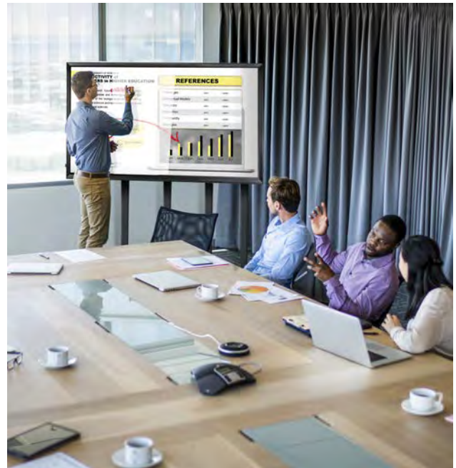
LG Interactive Digital Boards - 86TR3D & TC3D Series