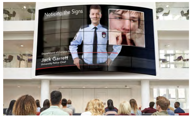
Open-Frame Curved OLED Displays - 55EF5C

Insuring the safety of everyone on campus is a top priority. In the event of an emergency a digital signage network can deliver critical information without delay and provide necessary directions to insure the safety of everyone on campus all in real-time.