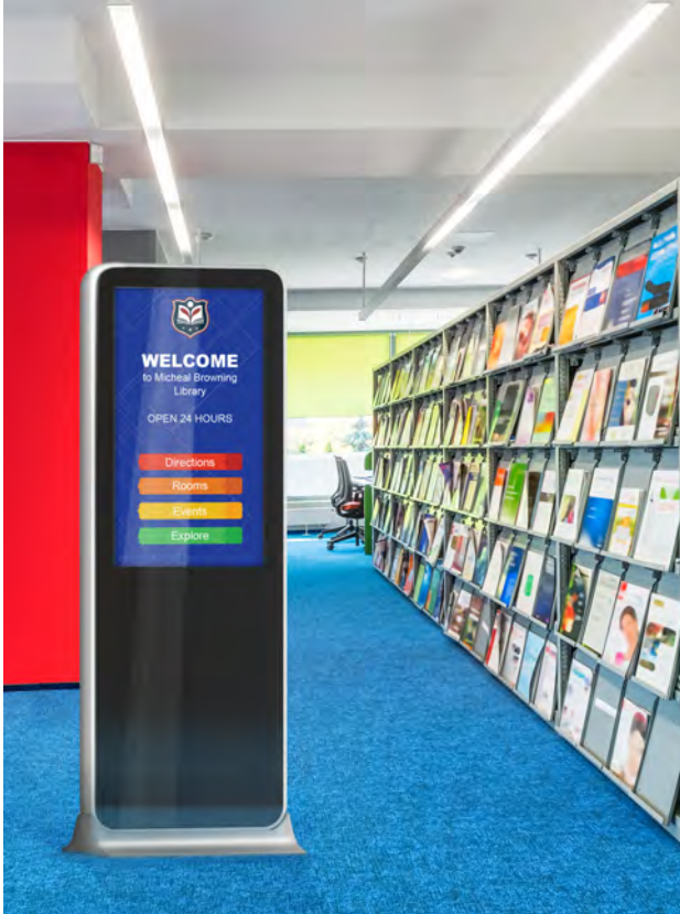
LG Smart Platform Digital Signage - 49SM5KD with LG Touch Overlay Kit - KT-490