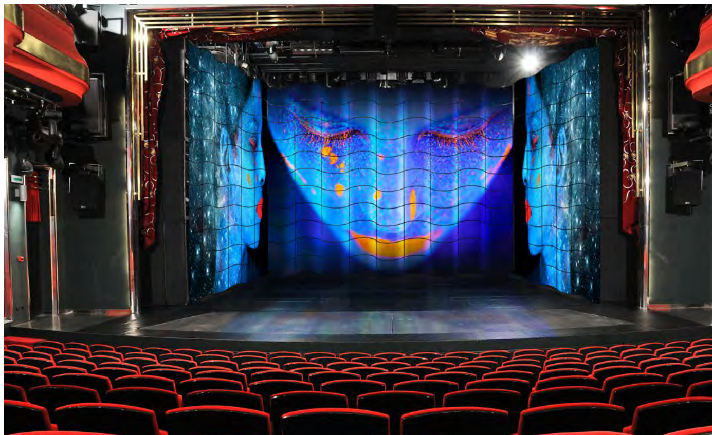
Open-Frame Curved LG OLED Displays - 55EF5C