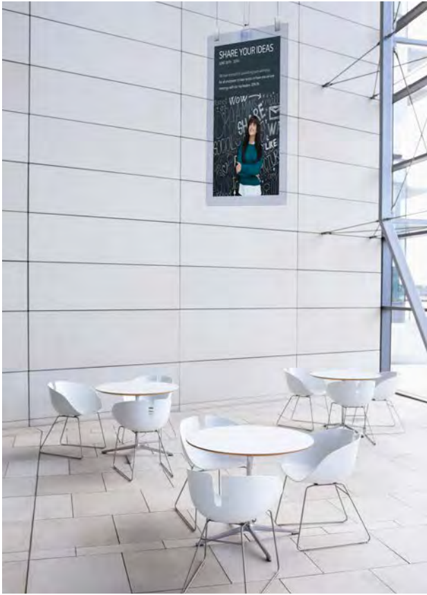
Dual-View Flat LG OLED Display - 55EH5C