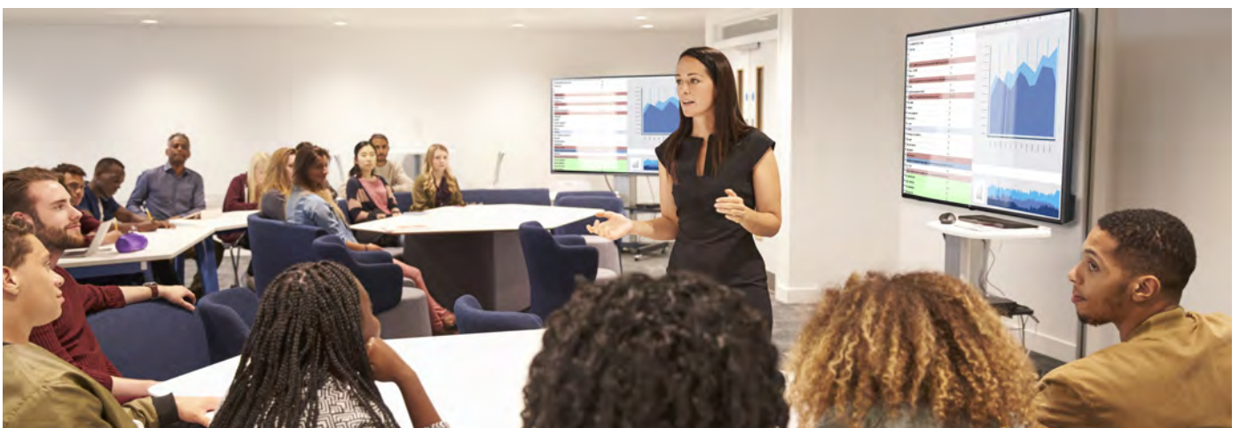
LG UHD Commercial TV - 75UJ340C

Most importantly visually attractive signage helps students learn. In a study by McGraw Hill, 75% of students using adaptive learning technology including touchscreens and digital screens in classrooms reported that it was very or extremely helpful. A further 77% reported it improved engagement, with signs and interactive screens making focus, attention spans and concentration easier ix .