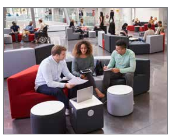
Protecting what matters most