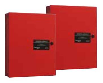
SK-PS6 and SK-PS10 Distributed Power Supplies

The SK-PS6 is a 6 amp and the SK-PS10 is a 10 amp, remote power supply with battery charger that may be connected to any 12 or 24 volt fire alarm control panel (FACP) or used as a standalone power supply. The PS Series provides 24 VDC power for NACs (notification appliance circuits) configured as either Class B or Class A (requires the ZNAC-PS optional card) with multiple sync protocol options.