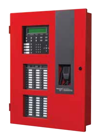
Up to 1,110 points for large installations or complex projects For more information on the 6820EVS see Pages 8-9.