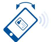
Twist & Go