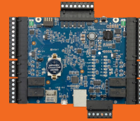
X1100 Two Door Controller

Once you complete the training, you'll qualify for a free year of service for a customer account using HID Aero Access Control—valued at over $1,500!