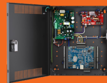
X1100-2PSE Two Door Controller & Power Kit