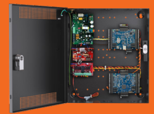
X1100-4PSE Four Door Controller & Power Kit