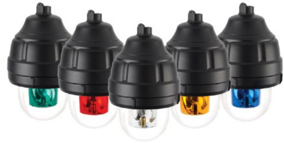
(Shown with pendant mount. See how to order for mounting options)