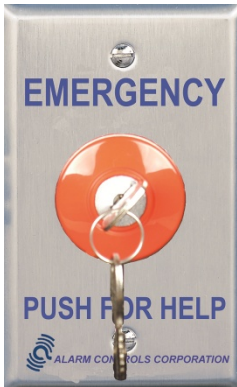
Model KR-1 Latching Push Button With Key Reset