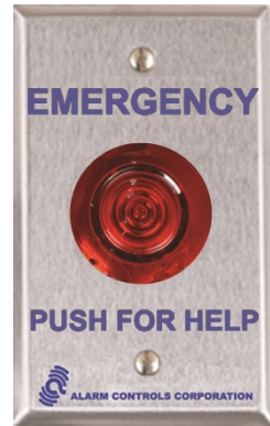
Model PBL-1-L2 Latching Push Button With Illuminated Button