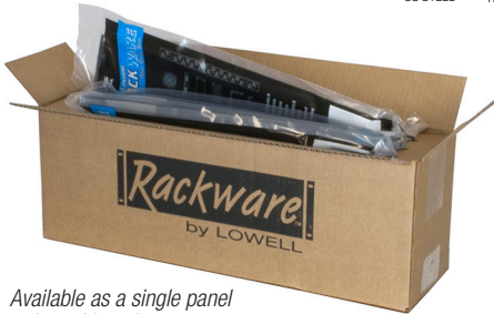
Available as a single panel or in multi-pack cartons.