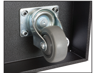
Fine floor caster