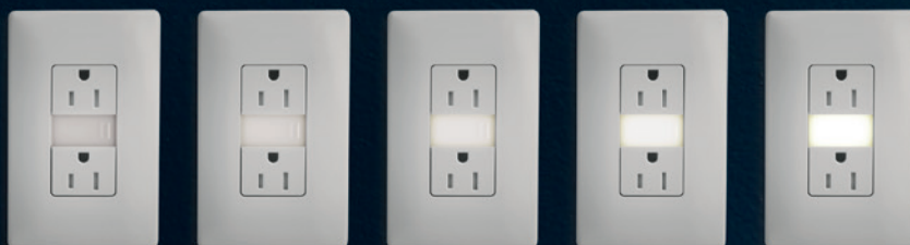
5 Adjustable Light Settings with Soft Glow energy-efficient LEDs

From tamper-resistant to touch-control to GFCI combos, we now offer a full line of Night Light devices designed to meet the demands of every end user and installer. So, whether your customers are looking to install extra nighttime convenience, control, safety — or all three — make sure you make it a P&S Night Light solution from Legrand.