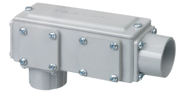
935NM ships as LB