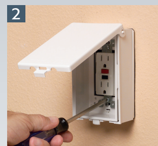
Install wiring device per manufacturer's instructions, Local and National Electrical Codes using the pre-drilled holes in base.