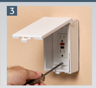
Install plate and the installation is done!