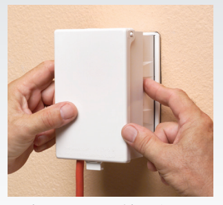
To close: Bow out sides of extended cover and push in.