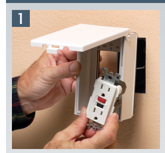
Feed device through opening (cover is removable for easier access).