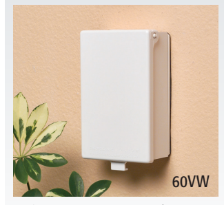
IN for GOOD LOOKS and to stay bug free...