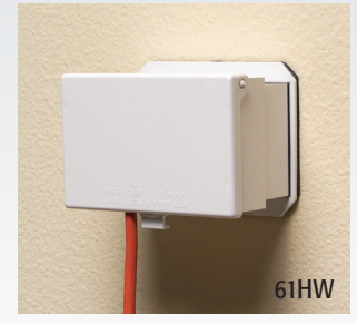
OUT to PLUG IN for weatherproof-in-use!