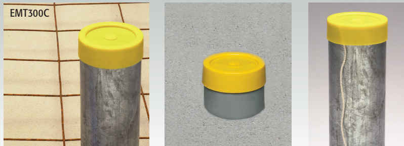
(String can be used to aid removal.)

Use this capped version to seal off conduit during concrete pours. Then remove cap/seal with razor knife or use screwdriver to punch hole in cap.