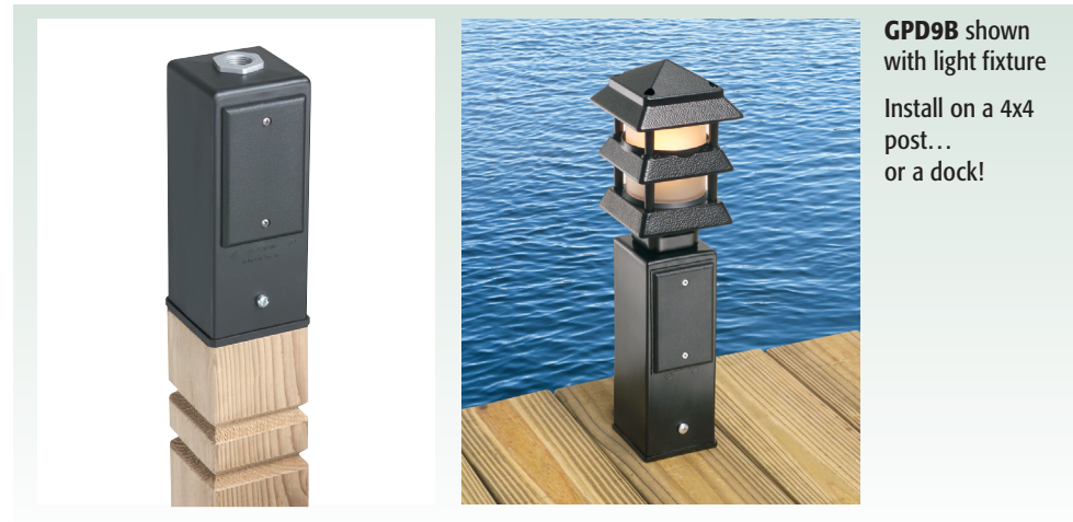
GPD9B shown with light fixture Install on a 4x4 post... or a dock!