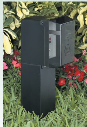
When you can have a great looking and long-lasting job like this!