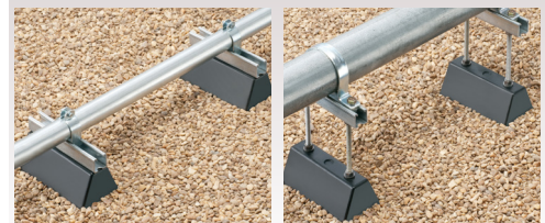
Raceway raised 12" above the roof