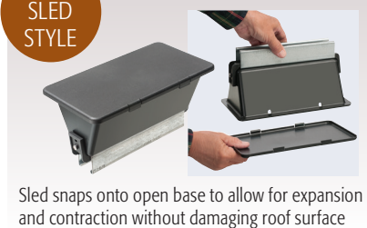
Sled snaps onto open base to allow for expansion and contraction without damaging roof surface