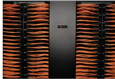
VPCA-12 shown with two RS-07 racks and angled patch panels