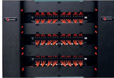
Comprehensive cable management can be created using Siemon's RS-07 and HCM Series horizontal cable managers