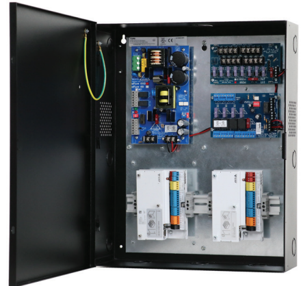
T1AXK3F2S with two (2) A1210 DIN Rail is included