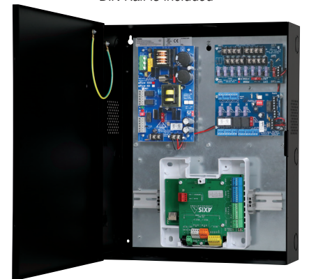
T1AXK3F2S with one (1) A1610 DIN Rail is included

Axis Communications boards are not included