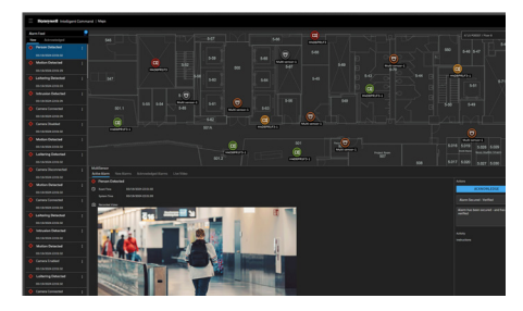
Pro-Watch Intelligent Command