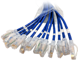
EZ Patch Clarity Flat Pack, EZFFPM609Q12-06

EZ Patch boxes, available in both Clarity and Reduced Diameter options, provide a “tissue box” like dispensing solution, eliminating tie wraps and cord memory; the cords dispense one after another, ready to install. The next generation of EZ Patch solutions, EZ Patch Flat Pack. This enhancement provides bulk packaged Clarity or Reduced Diameter patch cords straight and flat, offering a quick and convenient way to introduce new cabling to a data center or building network while enabling a cleaner, dust-free application when cardboard is prohibited in the data center. Together, EZ Patch solutions provide a better way to patch.