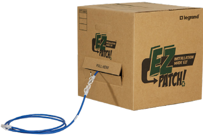
EZ Patch Boxes & Reduced Diameter Boxes, EZC6A05Q50-05