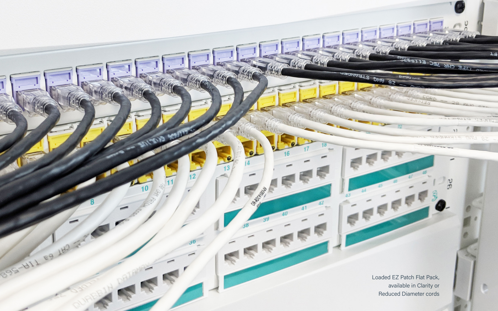
Loaded EZ Patch Flat Pack, available in Clarity or Reduced Diameter cords