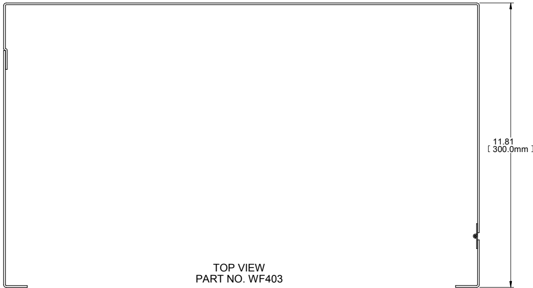
TOP VIEW PART NO. WF403

UNLESS OTHERWISE SPECIFIED DIMENSIONS ARE IN INCHES TOLERANCES: FRACTIONS ±1/32" ANGLES ±1/2° 3 PLACE DECIMALS ±.005" 2 PLACE DECIMALS ±.01"