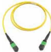
MPO 12-Strand, OS2