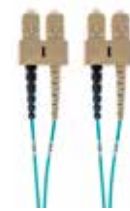
SC to SC, OM3 DFRCSCSCE1MM