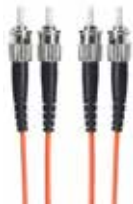
ST to ST, OM1 DFRCSTSTC1MM