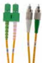
FCA to SCA, OS2 DFRCFCASCAS1SM