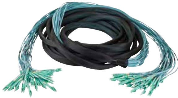
LC Mesh Bundle Trunk, OM3, 48-Strand