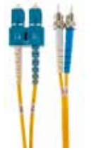
ST to SC, OS2 DFRCSTSCS1SM