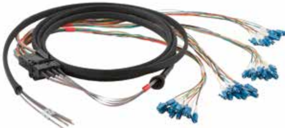
LC Ribbon Fan-Out, OS2, 48-strand FRPTR48LC6SL25F