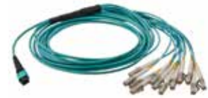
MPO-LC Hydra, OM3