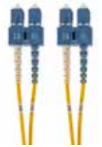
SC to SC, OS2 DFRCSCSCS1SM