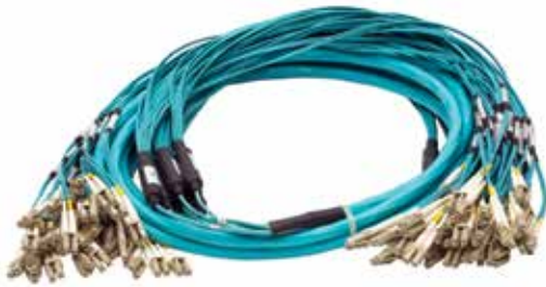
LC Fan-Out Trunk, OM3, 48-Strand