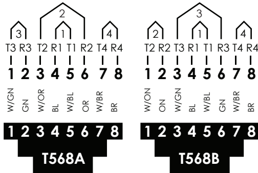
Figure 1: Wiring Schemes