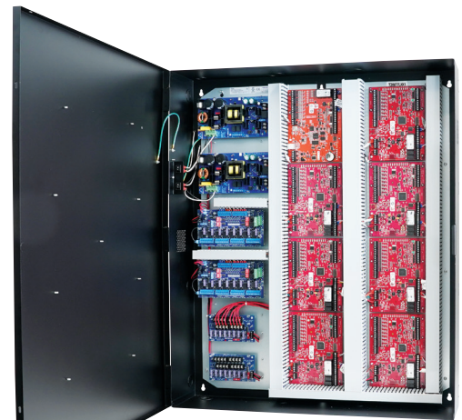
T3M77LXK1 - includes (2) AL1024ULXB2, (2) ACMS8, VR6, (2) PDS8, wire harnesses and finger duct

AccessNsite, Avigilon, BadgePass, BluBox, Feenics, Genetec, Identocard, IMRON, Johnson Controls, Kastle, Keri Systems, LockState, Maxxess, Midpoint Security, NLSS, Open Options, Panasonic i-PRO MonitorCast, Quintron, RS2, S2 Security, Schneider Electric, Vanderbilt.