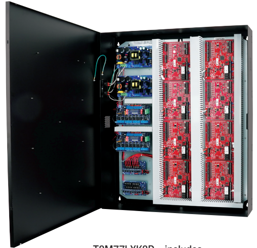
T3M77LXK3D - includes (2) AL1024ULXB2, (2) ACMS8CB, (2) VR6, (2) PDS8Cb, wire harnesses and finger duct

Altronix T3M77LXK3D is a 16-door access and power integration kit which includes Altronix power and sub-assemblies along with factory installed wire management and wire assemblies that are pre-configured with terminal blocks for Mercury hardware. This unit provides ample power and dual voltage outputs to support Mercury platform controllers and locking devices. The T3M77LXK3D accommodates up to eight (8) Dual Reader Interface Modules. Trove Plus simplifies field installations and provides reliable, robust critical power and control for the most demanding applications.