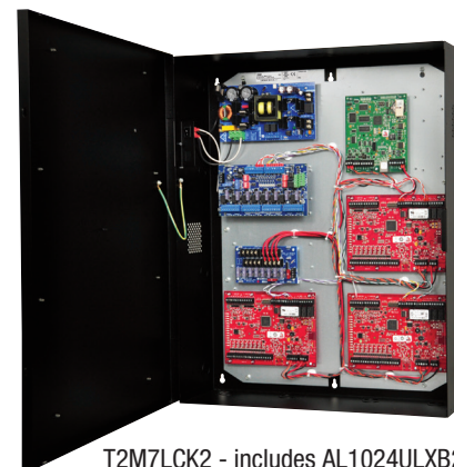
T2M7LCK2 - includes AL1024ULXB2, ACMS8, VR6, PDS8, wire harnesses and wire magnets

AccessNsite, Avigilon, BadgePass, BluBox, Feenics, Genetec, Identocard, IMRON, Johnson Controls, Kastle, Keri Systems, LockState, Maxxess, Midpoint Security, NLSS, Open Options, Panasonic i-PRO MonitorCast, Quintron, RS2, S2 Security, Schneider Electric, Vanderbilt