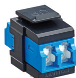
QUICKPORT LC Shuttered Adapter