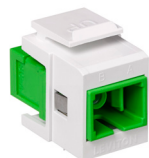
QUICKPORT SC/APC Adapter