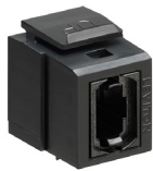
QUICKPORT MTP Adapter