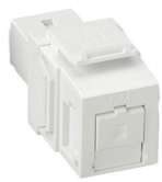
QUICKPORT SC Shuttered Adapter

QUICKPORT Fiber Optic Adapters provide connectivity for workstation cabling termination on single-mode and multimode fiber cable. QUICKPORT bulkhead modules snap into any housing with the QUICKPORT name: flush- and surface-mount outlets, multimedia outlet system (with adapter), patch panels, and patch blocks.