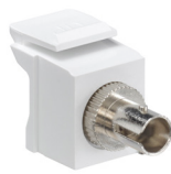
QUICKPORT ST Adapter