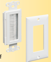
CED135WP w wall plate

Both are available with a decorator-style wall plate.