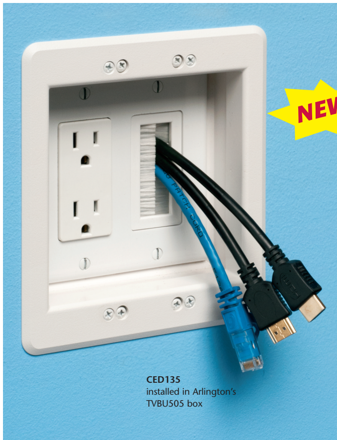
CED135 w brush opening

The Attractive Way to Organize and Protect Cable