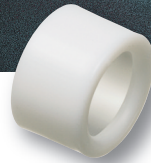
EMT50 1/2" Insulating Bushing for EMT