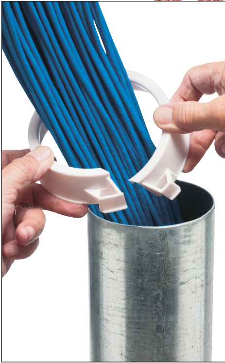
Easy installation on EMT!