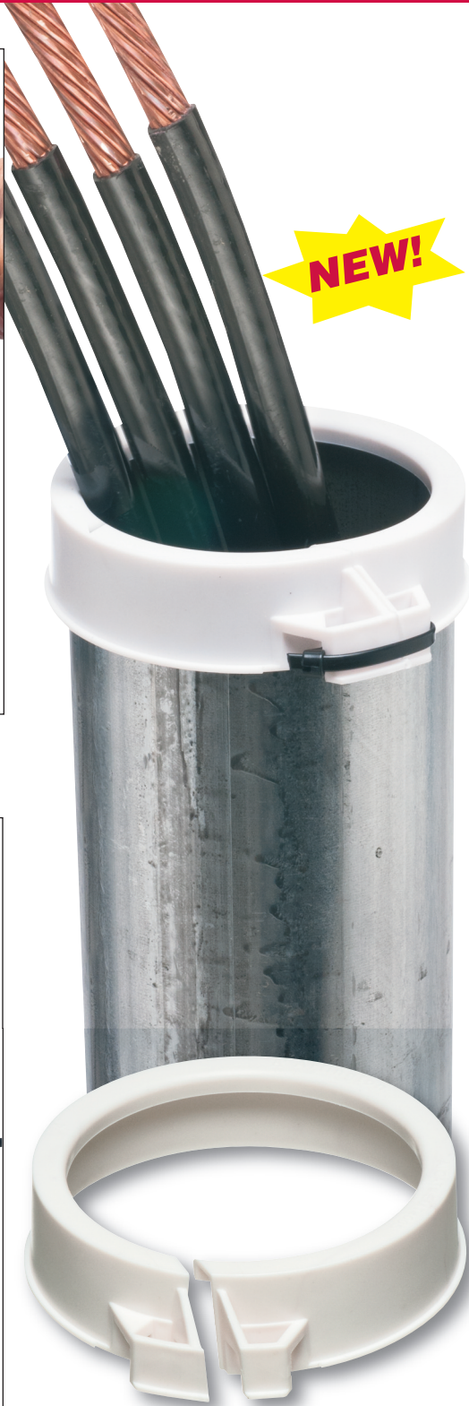
EMT400S 4" Split Insulating Bushing *Cable tie included

Arlington's non-metallic Insulating Bushings protect cable from abrasion when using EMT, Rigid, IMC or PVC rigid conduit – holding firmly in place as cable is pulled through.