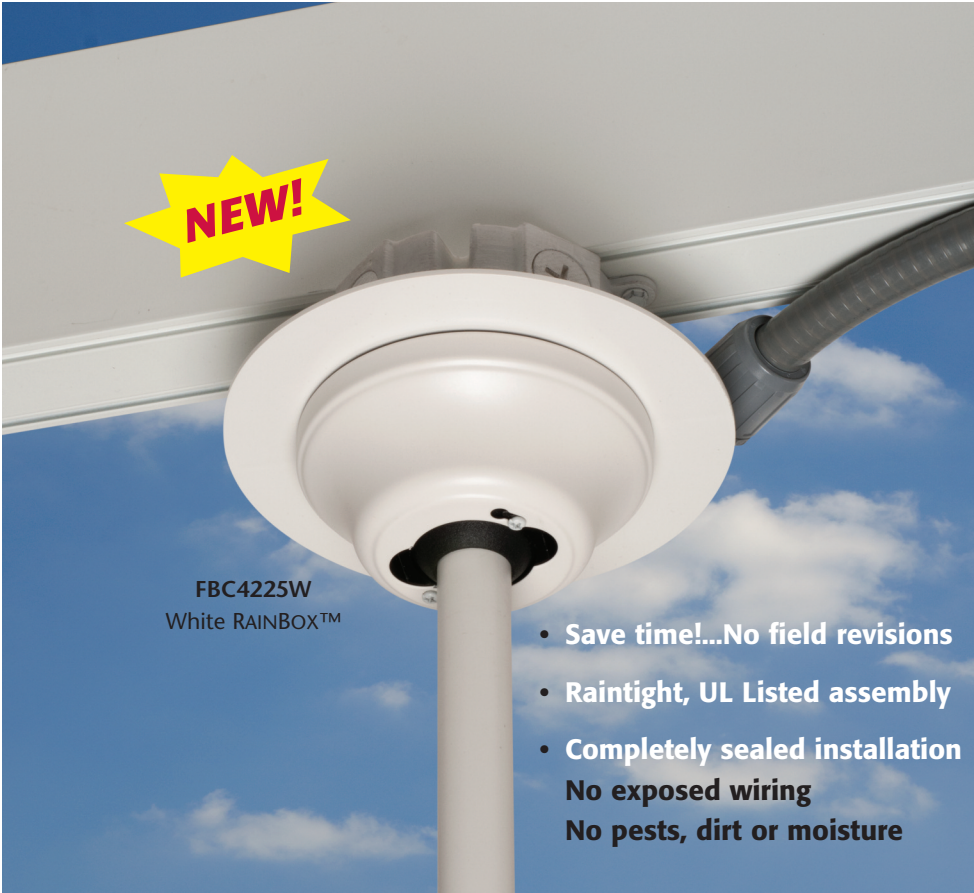
FBC4225W White RAINBOX™