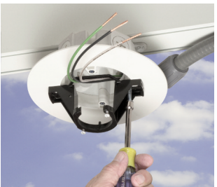
Attach fan/fixture bracket to structural member using supplied long screws (#12 x 4"). Connect wires and install fan/fixture per manufacturer's instructions.