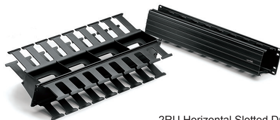
2RU Horizontal Slotted Duct