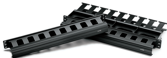
1RU Horizontal Slotted Duct

The Versi-Duct Horizontal Cable Management System uses slotted ducts to route cable. The ducts come with concealing covers and bend radius compliant routers. An assortment of compatible cable management accessories is available. They mount onto a standard 19-inch equipment rack.