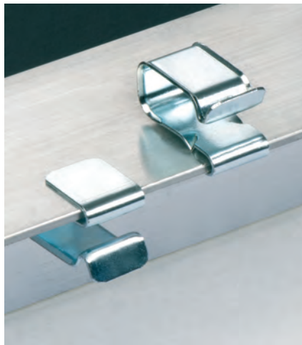
Choose the method of attachment that works best for you.