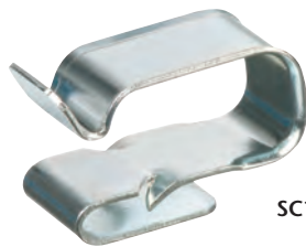
SC100 Galvanized Steel Wire Clip