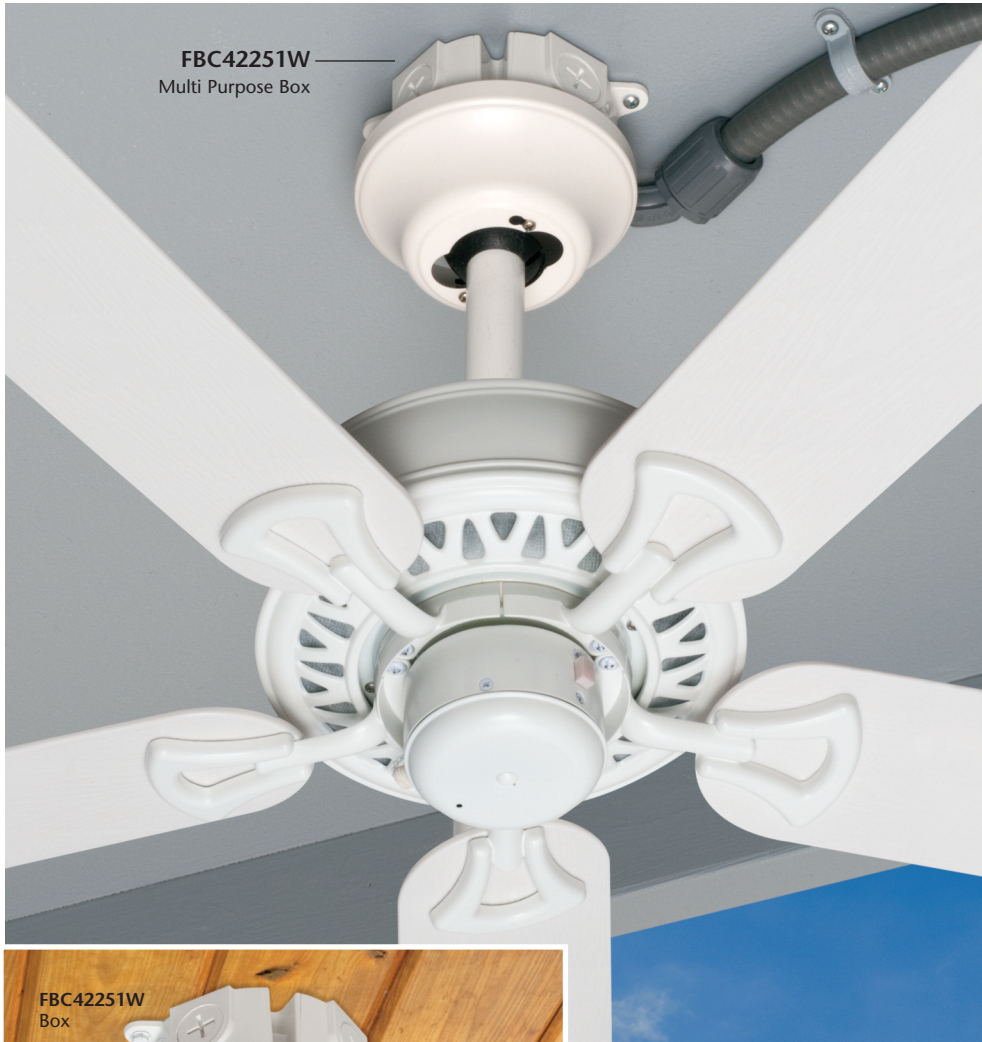
FBC42251W Multi Purpose Box

Raintight, Sealed Box for Wet or Damp Exterior Locations