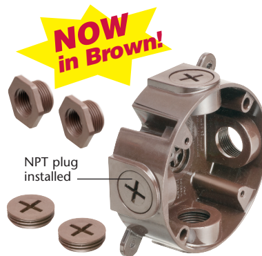
FBC42251BR Box components Includes screws for fan installation

Arlington's non-metallic 21.8 cu. inch MULTI PURPOSE BOX is the labor-saving solution to installing a fan, light fixture or security camera that's exposed to the elements – inside or outside. This MULTI PURPOSE BOX eliminates the need for time-consuming field modifications.