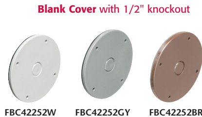
Blank Cover with 1/2" knockout

Includes non-metallic cover with 1/2" knockout, (1) gasket and (4) #6-32 mounting screws.