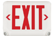
EVC Combo Exit/ Light