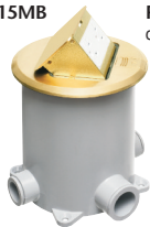
FLBT6615MB open on FLBC4500 concrete box