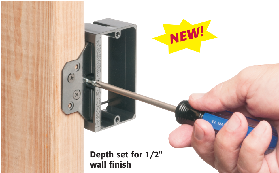
Depth set for 1/2" wall finish

For Class 2 Low Voltage Wiring • Non-Metallic