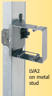
LVA2 on metal stud