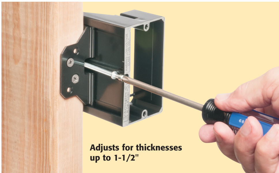
Adjusts for thicknesses up to 1-1/2"

Arlington's non-metallic adjustable mounting brackets are perfect for low voltage installations when the final wall thickness is unknown.