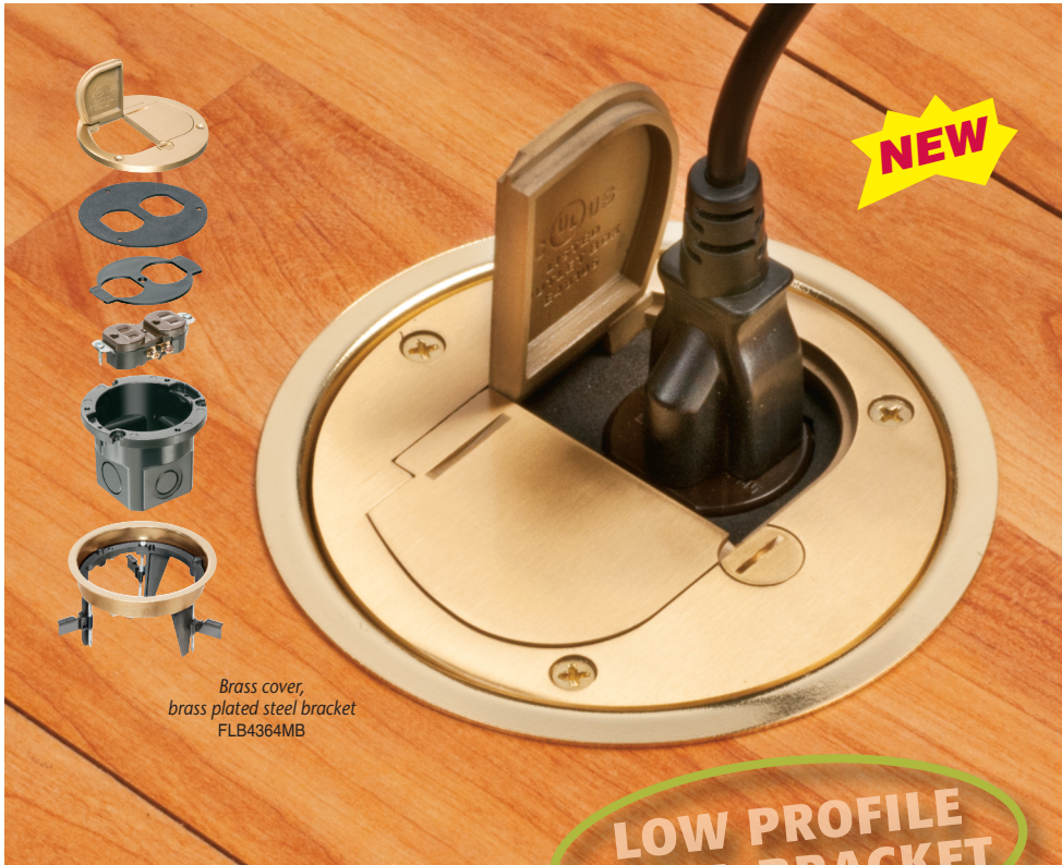
Brass cover, brass plated steel bracket FLB4364MB

Fastest, FLUSH installation • Low Profile Metal Covers, Steel Bracket