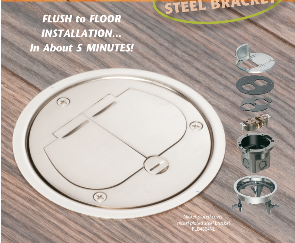
Nickel-plated cover, nickel plated steel bracket FLB4364NL

FLUSH to FLOOR INSTALLATION... In About 5 MINUTES!