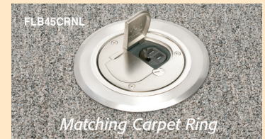
Matching Carpet Ring