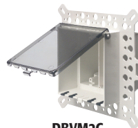
DBVM2C Two-gang for Stucco

IN BOX meets 2017 NEC, Section 406.9 (B) for the protection of exterior outlets which require the use of an extra-duty weatherproof while-in-use cover for all outdoor 15 or 20 AMP receptacles. Also meets 2015 CEC (Rule 26-702) for receptacles exposed to the weather.