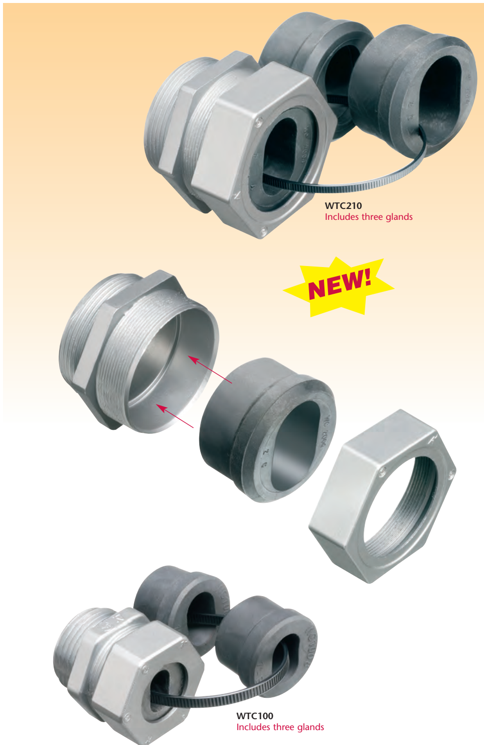
WTC210 Includes three glands

Now with glands that handle a range of cable sizes