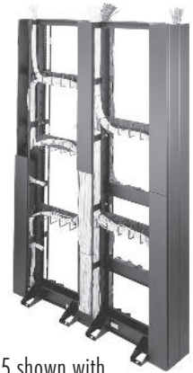
(2) RL10-45 shown with optional cable organizers and covers

OPEN FRAME RACK ACCESSORIES CANTILEVER SUPPORT BASE CENTER CABLE ORGANIZER END CABLE ORGANIZER CABLE ORGANIZER COVERS