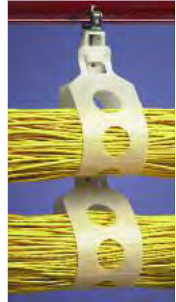
MULTIPLE LOOP HANGERS Stacked, parallel mounting on 1/4" rod