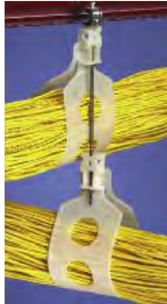
MULTIPLE LOOP HANGERS Stacked, perpendicular mounting on 1/4" rod