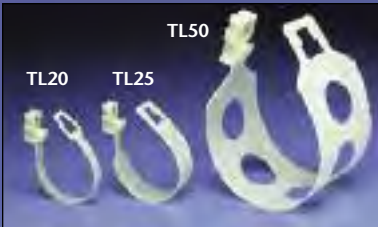
TL50 patented for a 5" cable bundle

Flexible and non-metallic, The LOOP ® provides sturdy, reliable support of CAT 5, 6 or 7 – or fiber optic cable without sagging, bending or damaging the cable! The LOOP holds up to a 5" diameter bundle of cable.