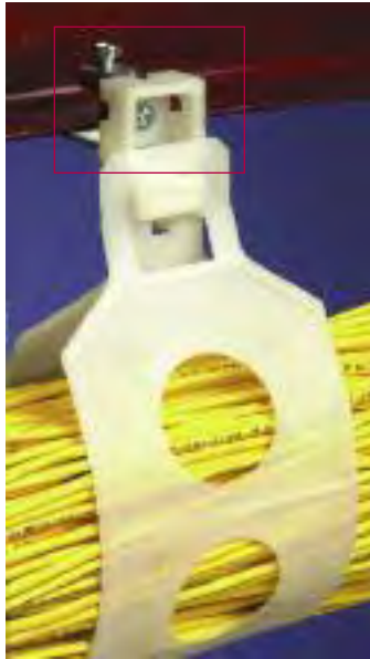
SINGLE LOOP Parallel mounting on 1/4" beam clamp