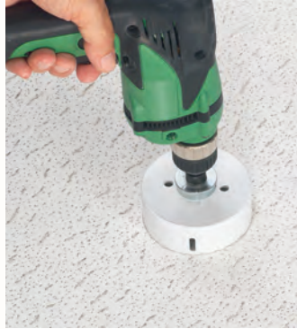
1 Cut hole in the desired location in the ceiling with a hole saw.

Installing a fixture with Arlington's CAM-LIGHT™ Box is quick, easy and secure.