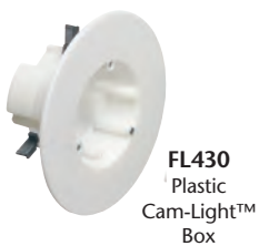
FL430 Plastic Cam-Light™ Box