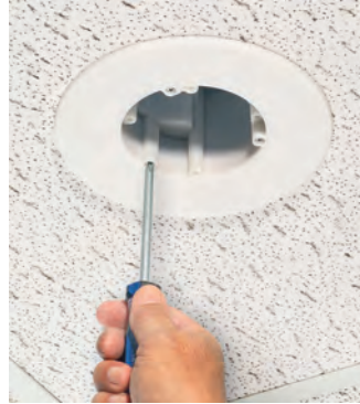
2 Align fixture as necessary. Tighten mounting wing screws.