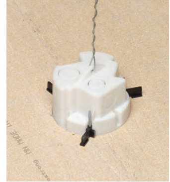
3 Attach drop wire to loop. Attach to framing member for 50 lb rating.