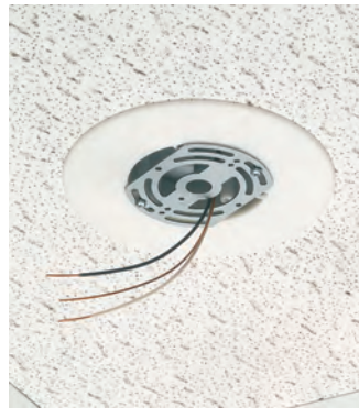
5 Ready for installation of fixture or detector.