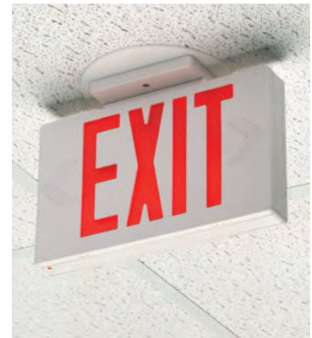
6 Finished installation on suspended ceiling. 50 lb rating with a drop wire. Secure, no sagging ceiling.