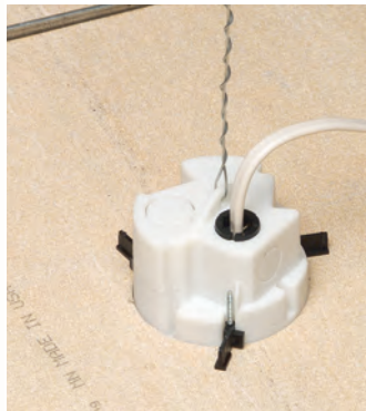
4 Choose the appropriate knockout (1/2" or 3/4"). Install supplied NM cable connector. Pull cable.