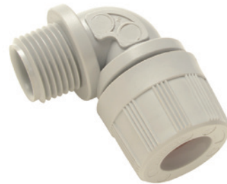
Nylon Cord Grip 90°