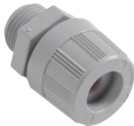
Nylon Cord Grip Straight