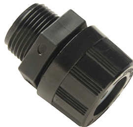
Black Nylon Cord Grip Straight