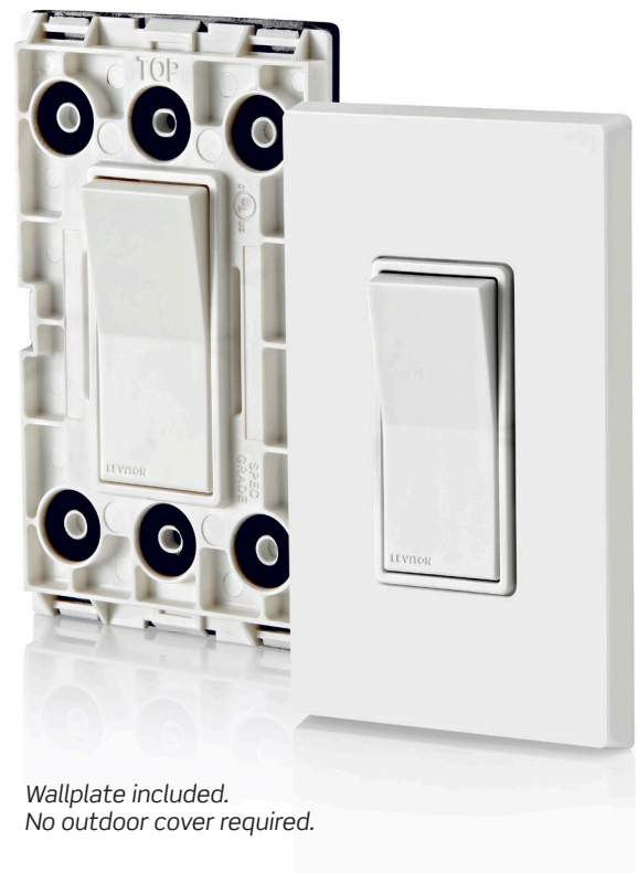
Wallplate included. No outdoor cover required.

Ideal for residential and commercial outdoor kitchens and bars, outdoor lighting, patio, pool and spa areas, sheds, gazebos, cabanas, outdoor ceiling fans, and fountains.