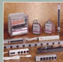
Power & Data Quality