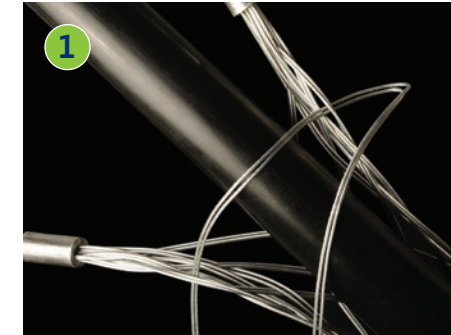
1 Start the lacing from the 'eye' end or anchoring end of the cable grip.

PLEASE NOTE: The images shown here use double weave cable grips. When lacing single weave cable grips please use single wire lace; use double-laced for double weave cable grips; and use triple-laced for triple weave cable grips.