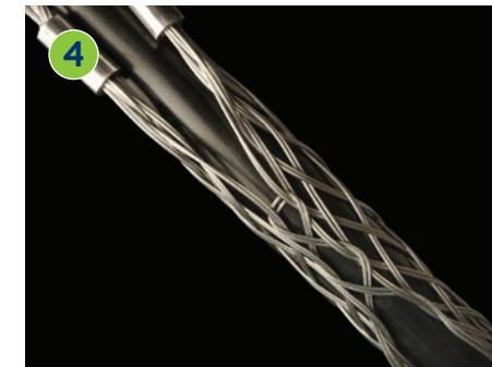
4 Continue down the length of the cable grip. Try to maintain equal tension and equal spacing throughout as this leads to a more stable and equal grip.