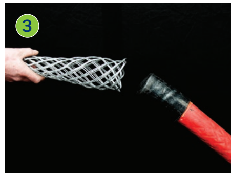
3 The grip should then be placed over the end of the conductor...