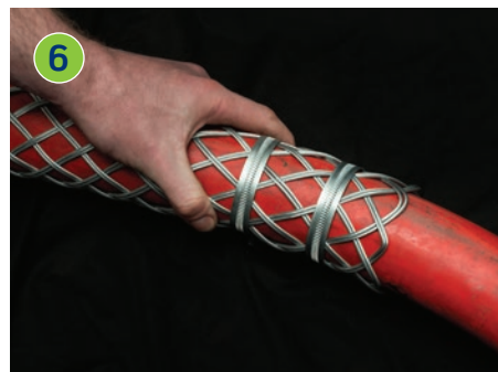
6 Once the cable grip is in place on the conductor, two clamps should be fitted to the end of the grip (as shown). We recommend between 1 ¼" (30mm) and 2 ¼" (55mm) away from the end of the cable grip.