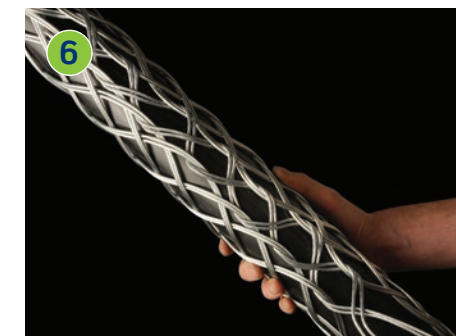
6 Try to achieve an even and neat lace-up as this assists with the strength of the grip when pulling.