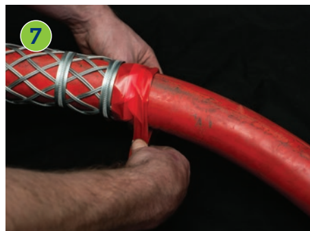
7 Tape should then be wound around the end of the cable grip furthest away from the eye ends.