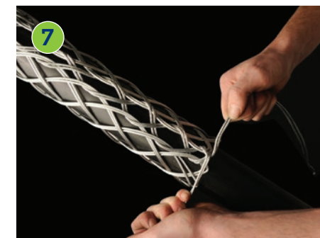
7 Finally, tie the ends of the lace once or twice round the end of the cable grip twisting the ends together securely. Excess lace can be cut off.