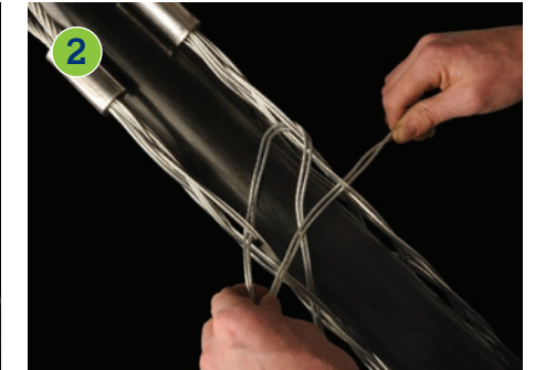
2 Thread the lace through the first two loops of the split and pull through until the laces are centered at this point.