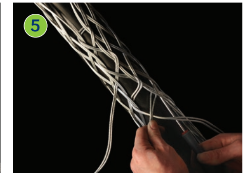
5 As you continue down the length, pull the open sides of the grip as wide apart as required.