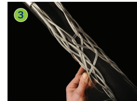
3 Don't pull the lace too tight at this stage. Leave a space between adjoining loops roughly equal to the width of one diamond of the mesh.