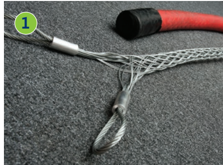
1 Select the correct grip for the diameter of the conductor.

PLEASE NOTE: The condition of the cable grip should always be checked prior to use. The correct size of grip should always be used for the intended application. The rated capacity of the grip should never be exceeded. Grips that are worn, bent or otherwise damaged should not be used.