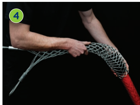
4 ...and pushed over the conductor.