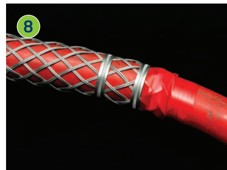
8 This will prevent the cable grip from snagging when in use.