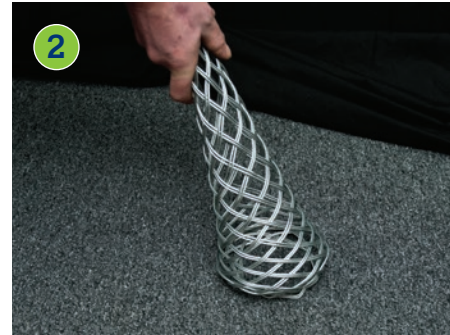
2 Prior to use, the lattice at the end of the grip needs to be widened. This can be easily achieved by pressing the end of the grip against a hard surface, which causes the lattice to expand.