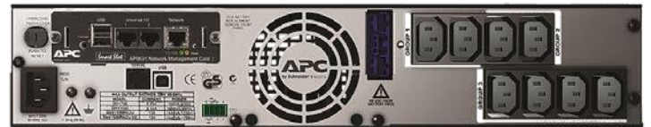
[ SMX1500RM12UNC ]