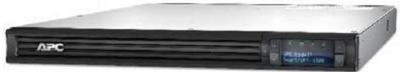
[ SMT1500RM1U ]