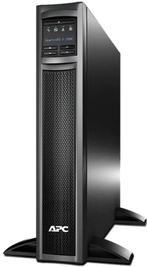
[ SMX1500RM12U ]

Convertible extended run models ideal for critical servers and voice/data switches.