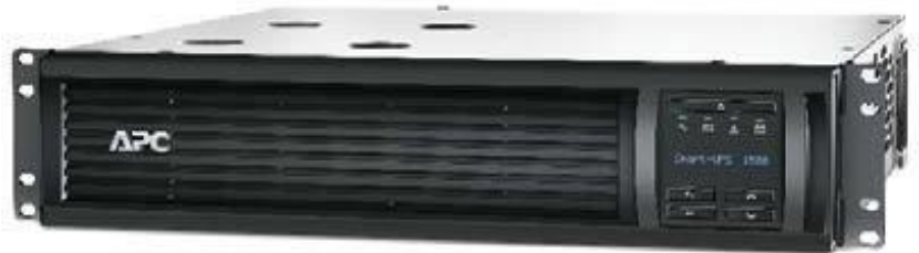
[ SMT1500RM2U ]