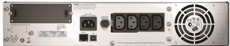
[ SMT1500RM2U ]