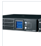
UPS Backup Systems