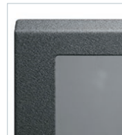
Plexi Front Door