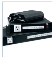
Power Distribution with RackLink™