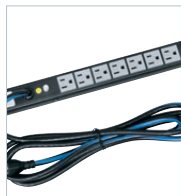
Vertical Power Distribution