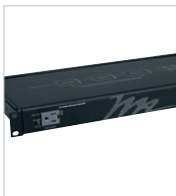
Horizontal Power Distribution