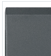
Solid Front Door