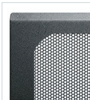
Vented Front Door