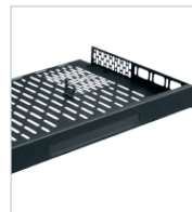
Rackshelves & Storage

CORPORATE HEADQUARTERS 300 Fairfield Road Fairfield, NJ 07004, U.S.A. Voice: 800-266-7225 Fax: 800-392-3955 International Voice: +1 973 839-1011 International Fax: +1 973 831-4982 middleatlantic.com