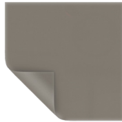
Da-TeX Half Angle: 30° Gain: 1.3

*NOTE: The Advantage Deluxe Electrol featuring Parallax will look visibly different when compared to other Da-Lite tensioned screens with vinyl surfaces. This is due to the nature of the Parallax material, which is a micro-layered, high-grade plastic lens system. While it may have slight variations in appearance, it is optically flat. Meaning, that when under projection, the Advantage Deluxe Electrol featuring Parallax will perform on the same level as the Da-Lite 4K-ready HD Progressive surfaces.