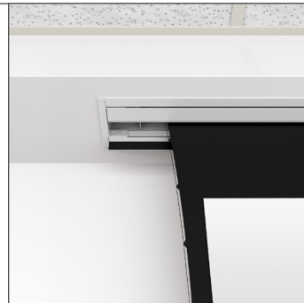
In Ceiling (Open)