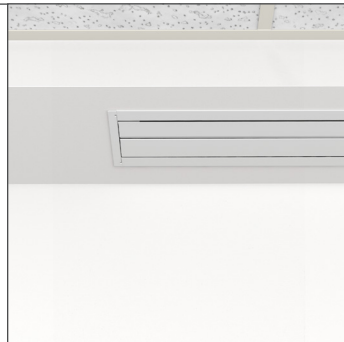
In Ceiling (Closed)